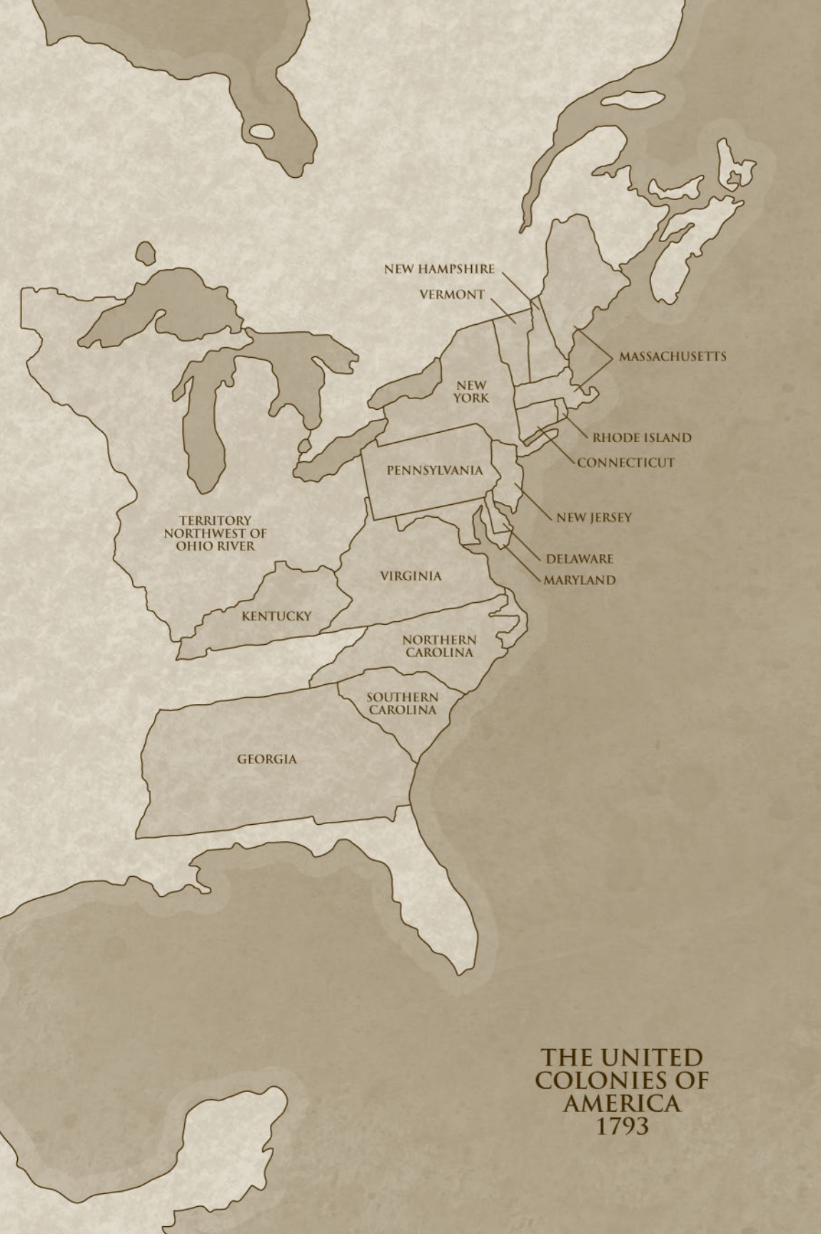
THE UNITED COLONIES OF AMERICA 1793